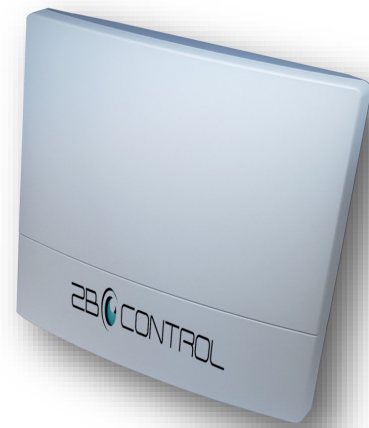
Antenna BLE with TCP/IP Poe connection

Personal control available: by equipping the staff with a wearable beacon, it is possible to have their location in real time, to optimize interventions.